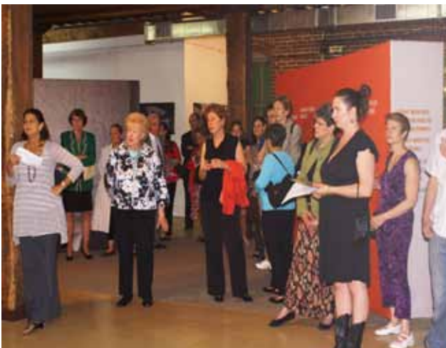
Museum guests look on during the opening remarks.