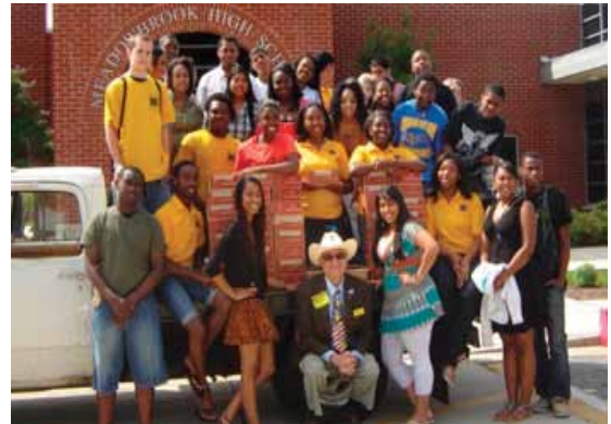
Top Right: The Academic Success Program at Meadowbrook High School collected 111,945 pennies.